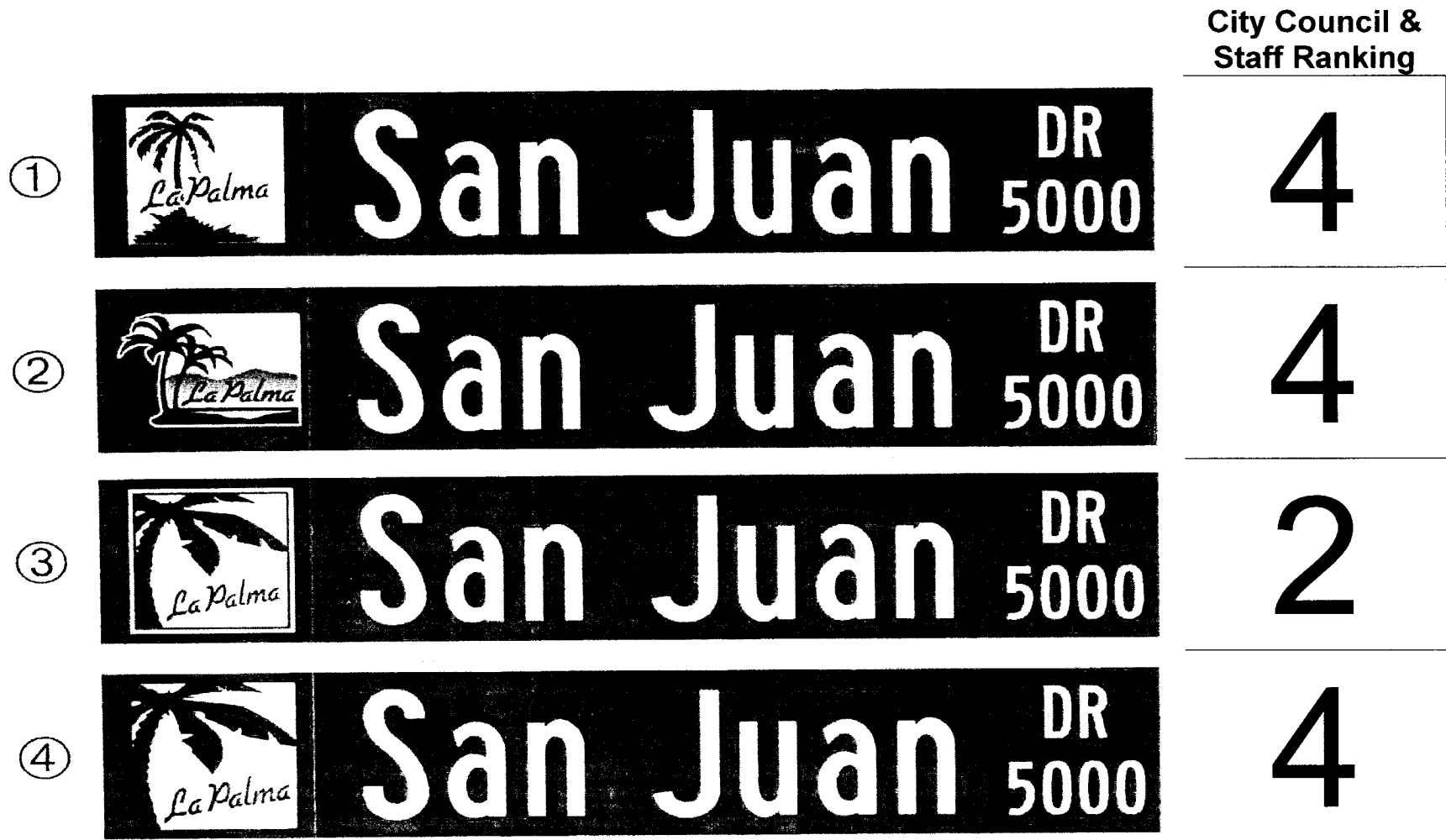
EXHIBIT A (3of3)